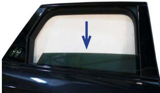
Shade fits from the outside