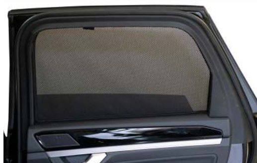
Repeat this whole process for the other side.