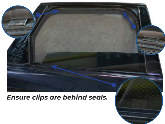
Ensure clips are behind seals.