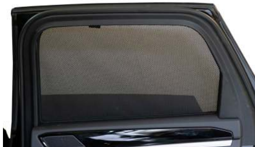
View from the inside side.