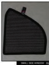
SMALL SIDE WINDOW X2