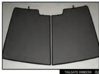
TAILGATE WINDOW X2