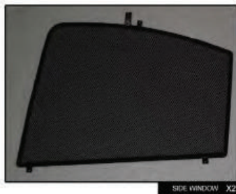
SIDE WINDOW X2