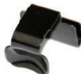
CL-M05 x 2