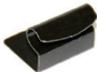
CL-M13 x 2