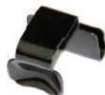
CL-M05 x 4