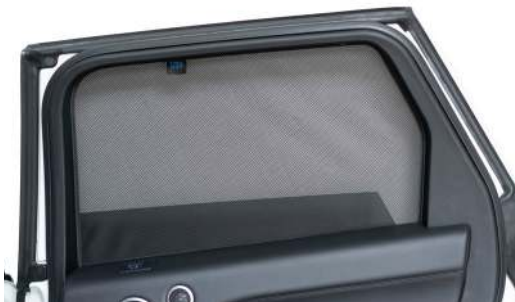
View from the inside side.