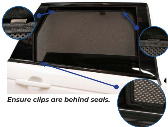
Ensure clips are behind seals.