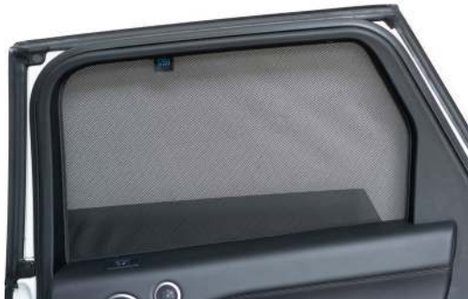
Repeat this whole process for the other side.