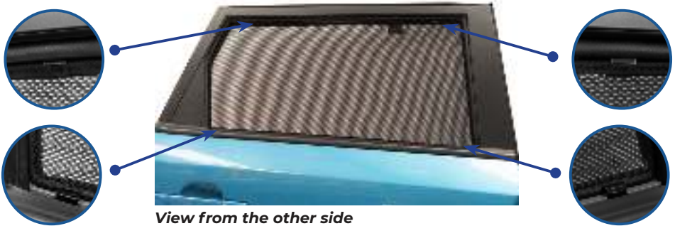
View from the other side