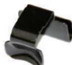
CL-M05 x 4